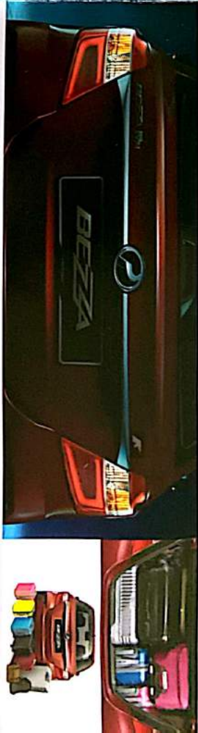
508L Luggage Space