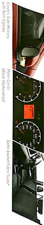
Electric Side Mirrors with Turn Signals