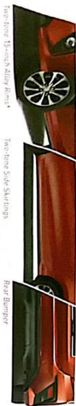
Two-tone alloy Rims*