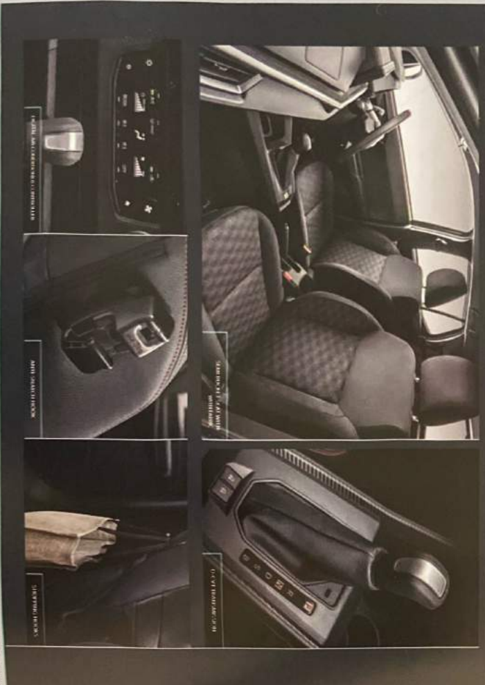
STEERING WHEEL WITH MULTIFUNCTION